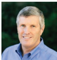
Gord Cooke Construction Instruction, Inc.